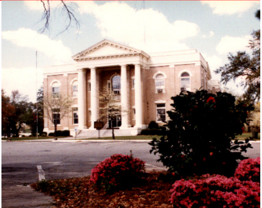
Dodge County Courthouse, est. 1939